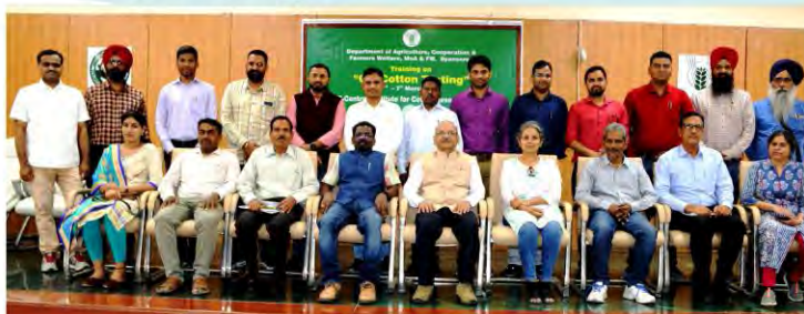
Director and Senior Officials of ICAR-CICR, Nagpur along with participants from State Seed Testing Laboratory (STL), Gujarat, Punjab and Rajasthan