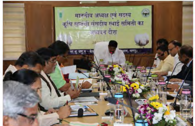
Members of Parliamentary Standing Committee on Agriculture conducting a meeting at ICAR-CICR, Nagpur during their visit to the Institute on 24 th January 2020.