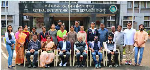
Director and Senior Officials of ICAR-CICR, Nagpur along with participants from State Seed Testing Laboratory (STL) Pune, Parbhani, Nagpur, Gondia and Wardha