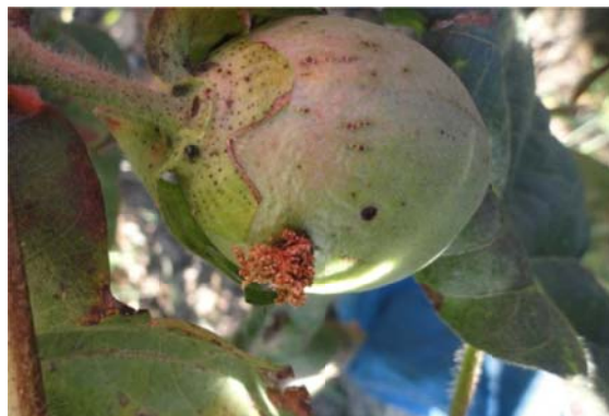
Green boll damage by PBW