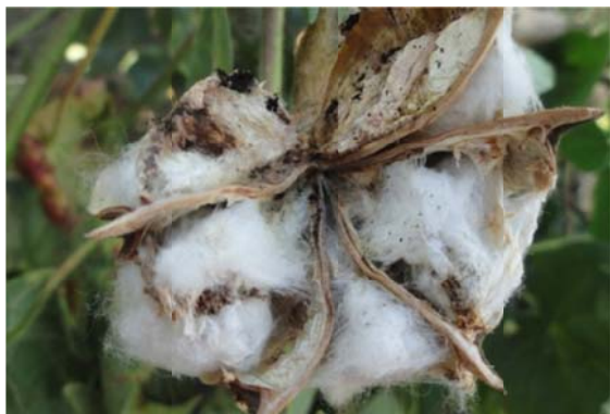
Open boll damage by PBW