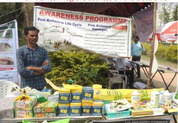
Exhibit of pheromone traps