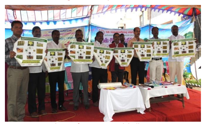
Release of Poster on Pink bollworm